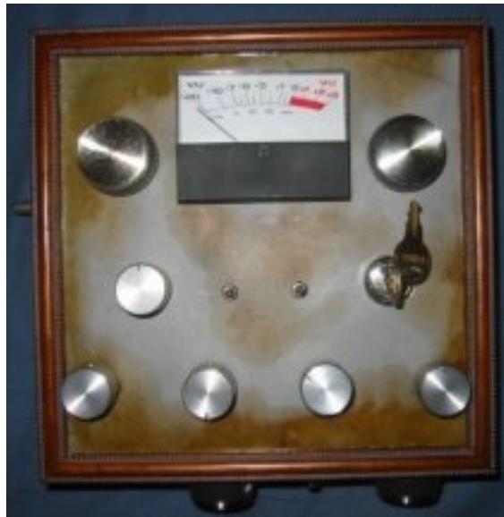
High impedance j-fet preamp for magnetic and piezo pickups.