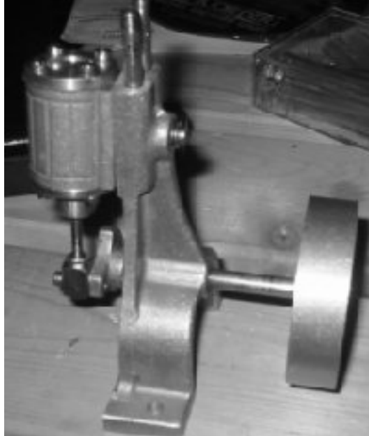
Working Steam Engine Machined for Steam Synthesizer

Steam powered synthesizer / kinetic sculpture.