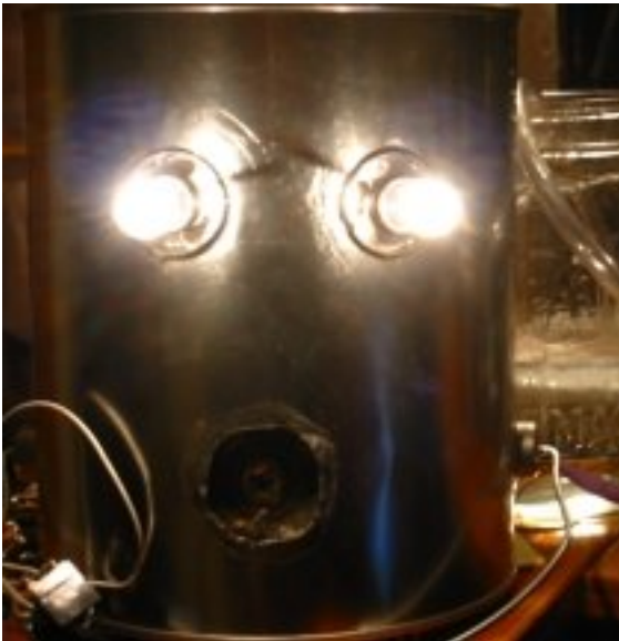
Insanium Abstract Speech Synthesizer.