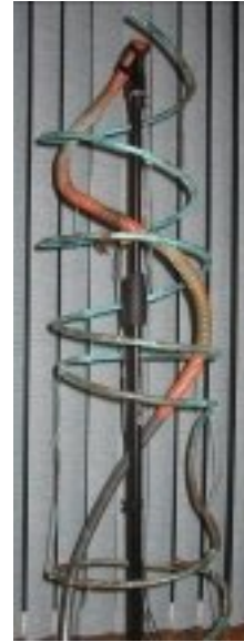
“Blood Brain Barrier” Kinetic Sound Sculpture Instrument.